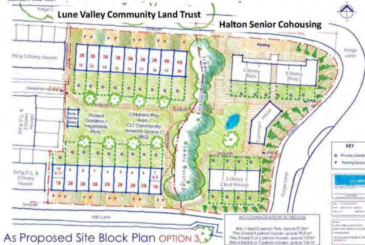
As Proposed Site Block Plan OPTION 3