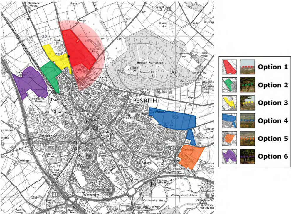
Penrith Housing Development Plan; Landscape and Visual Impact Assessment Appendix Page 26