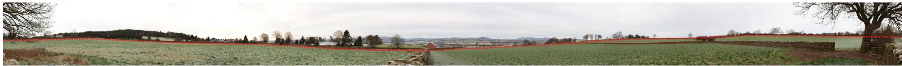
Viewpoint 14. From near boundary of Option Area 1 with properties on Fair Hill. (1.4km from Penrith Clock Tower)