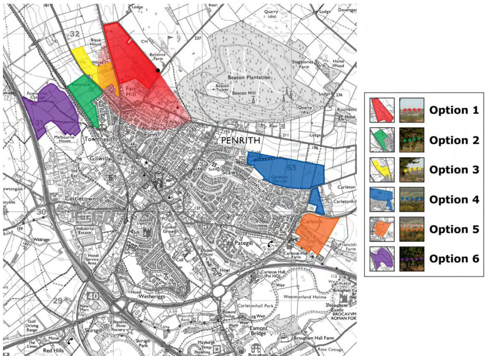
Penrith Housing Development Plan; Landscape and Visual Impact Assessment Appendix Page 28