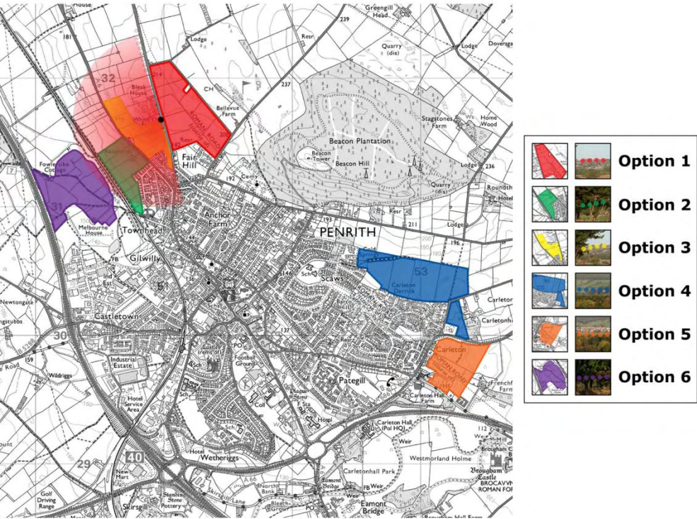
Penrith Housing Development Plan; Landscape and Visual Impact Assessment Appendix Page 25