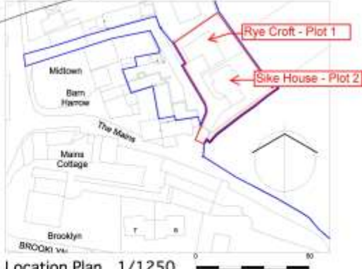
Location Plan 1/1250